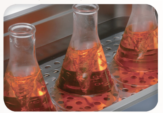
Compatible Bottle of SWB -20L-3