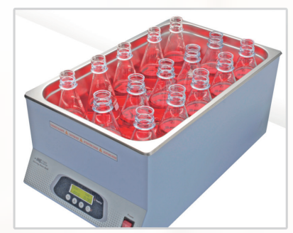
Max. chamber capability (no using stirring mixture function): 15 sets of 250ml flasks 8 sets of 500ml flasks