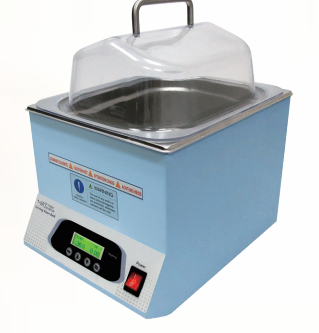
Built-in magnetic stirring mechanism