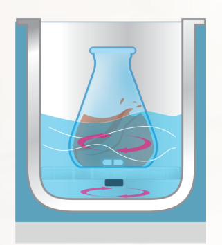
Water circulation function